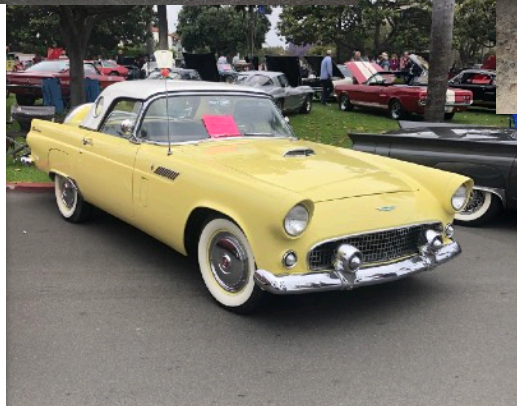
Shelly's bird lookin good with the top on!